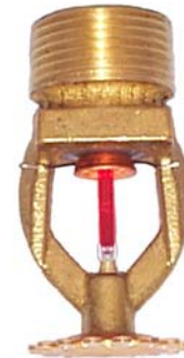
QUICK RESPONSE EXTENDED COVERAGE PENDENT