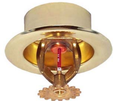
QUICK RESPONSE RECESSED EXTENDED COVERAGE PENDENT