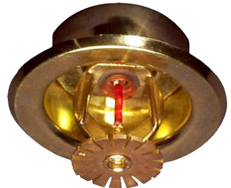
RESIDENTIAL RECESSED PENDENT