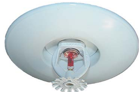
RECESSED PENDENT WITH OPTIONAL 4 1/2" SEISMIC RECESSED ESCUTCHEON